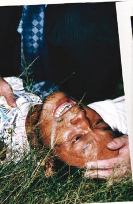
In the name of Jesus, three evil spirits fled, and this man was delivered, saved and baptized in the Holy Spirit. Today he is a worship leader in Nepal!