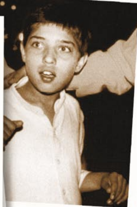
This deaf and mute boy in Pakistan was completely shocked to hear himself make noises in the microphone in front of 30000 people at the festival.