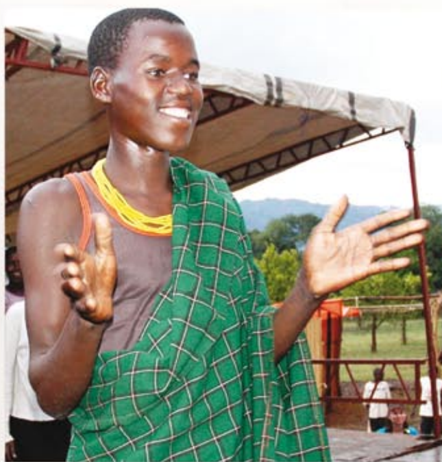
At the age of eight, this young Karamanjong boy lost his hearing completely. Accompanied by a friend at the same age, he arrived at the festival. During healing prayer, his ears were totally opened and here he joyfully demonstrates that he can hear the sounds behind him!